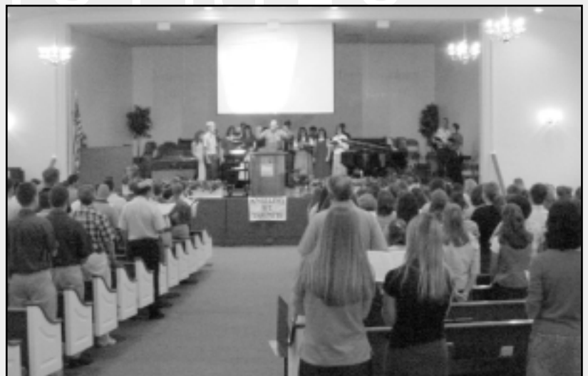
Song Time at YPA South

Brochures for these Advances will be available soon.