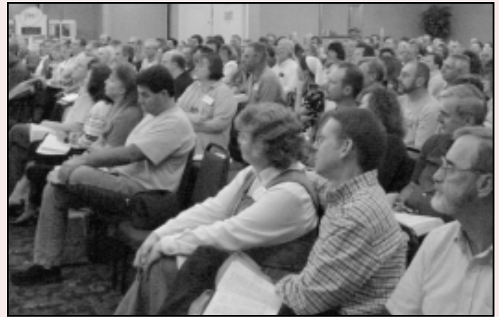
Session at Couples' Advance

All eight recorded sessions are available in an attractive album for $38 postpaid. Make checks payable to Christ Life Ministries.