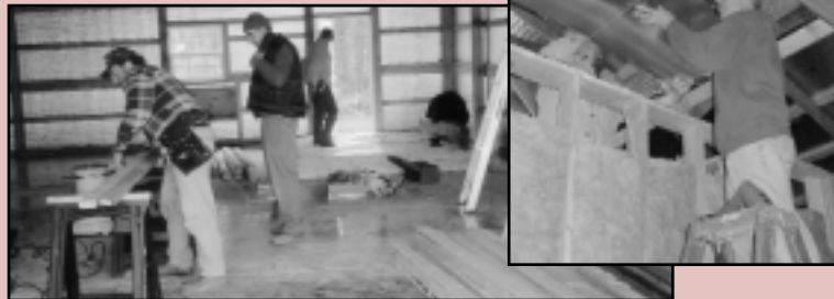
Framing New Building

A work crew from Keedysville, Maryland framed the interior building and installed a heat system. We are at the finishing stage and should be set up soon!